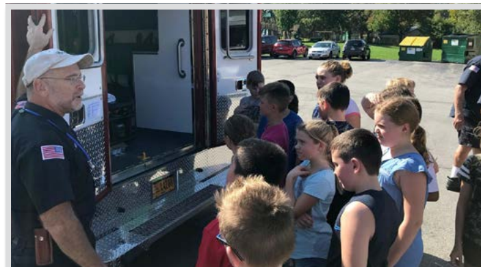
Cloverbank students toured an ambulance during Fire Prevention Week.