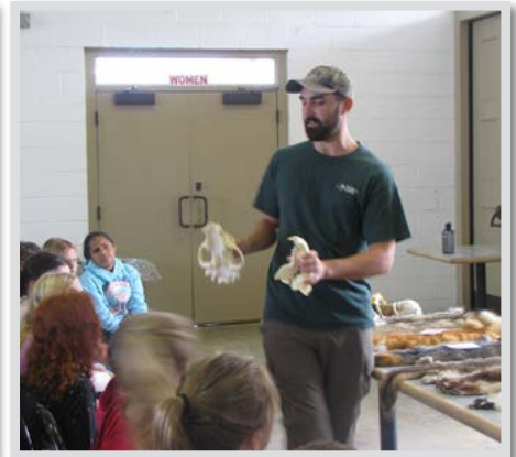
Students learned about animal adaptations at Evangola State Park.