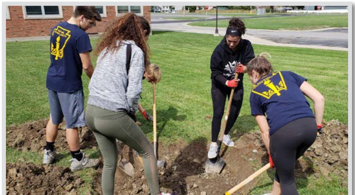
National Honor Society members worked with Lowe's employees and school administration to spruce up the high school's landscaping.