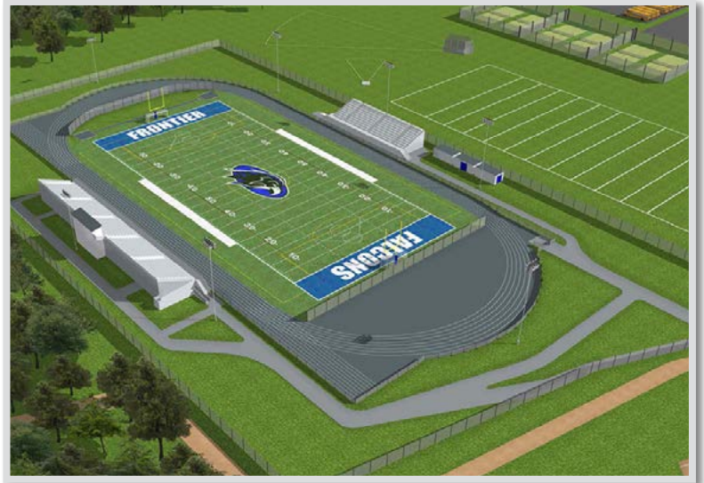
Voters approved the Multi-Use Field Project by 1425 to 370.

Construction of the track and the new turf field are planned to begin in 2020.