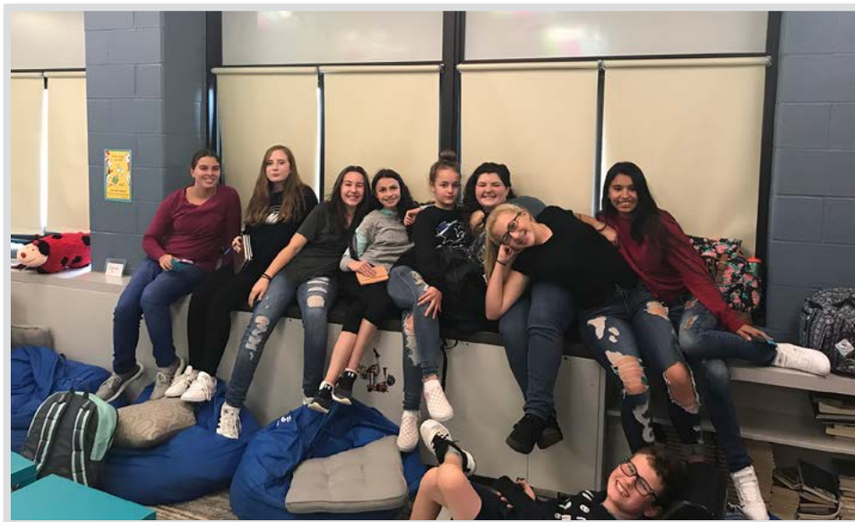
Middle School students have created a new club called The Voice, a student-run, online literary arts magazine.