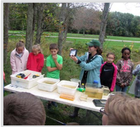
Fifth graders are shown tools used in researching a pond ecosystem.