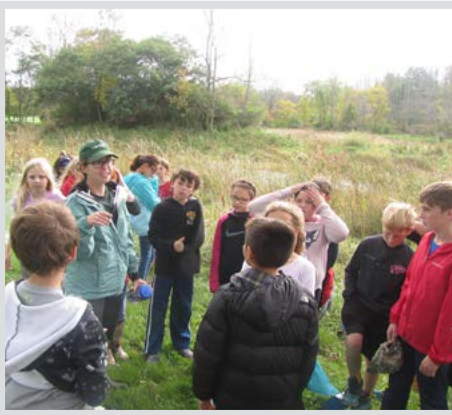
Fifth graders learn about the ecosystem at Evangola State Park.

On Oct. 11 and 12 fifth grade students at Pinehurst Elementary had a great field trip at Evangola State Park. Students were able to observe and analyze a pond ecosystem as well as experience hands-on learning of animal adaptations, which reinforces the current science unit. In addition, the field trip supports the science content featured in the novel Night of the Spadefoot Toads by Bill Harley, which is being read by the fifth grade.