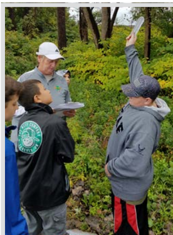
A student takes the air's temperature during the field trip to Reinstein Nature Preserve.