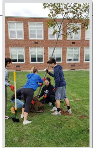
National Honor Society members worked tirelessly to spruce up the high school's landscaping.