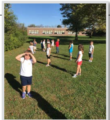
Kindergarten students look for the signs of fall outside Pinehurst Elementary on an 80-degree day.