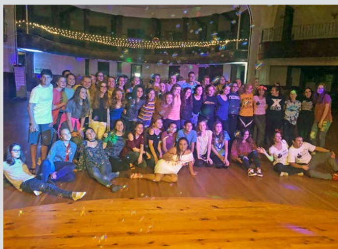
International Club members and Hamburg High School students went to Miniteca in Buffalo to learn about Latin music and dancing.