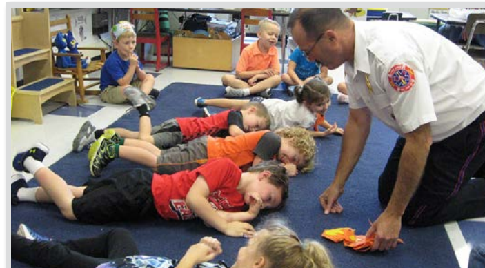
Cloverbank students practice Stop, Drop and Roll with a fireman from Lakeshore Fire Company.

Cloverbank students were visited by the Lakeshore Fire Company for Fire Prevention Week Oct. 7-13. Students were able to tour a fire truck and ambulance. Lakeshore firemen took the time to visit classrooms and demonstrate to students what to do in case of a fire. Students were given firemen hats and they practiced the safety tips. Cloverbank students and staff send a big "Thank You" to the Lakeshore Fire Company.