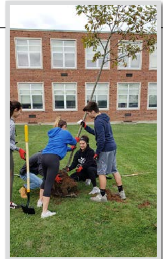
National Honor Society members worked tirelessly to spruce up the high school's landscaping.