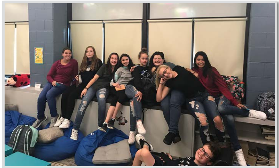
Middle School students have created a new club called The Voice, a student-run, online literary arts magazine.