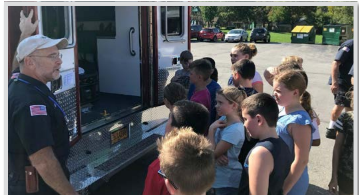
Cloverbank students toured an ambulance during Fire Prevention Week.