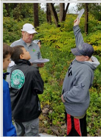
A student takes the air's temperature during the field trip to Reinstein Nature Preserve.