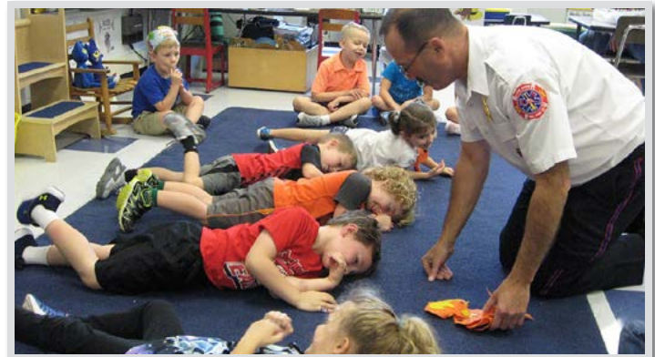
Cloverbank students practice Stop, Drop and Roll with a fireman from Lakeshore Fire Company.

Cloverbank students were visited by the Lakeshore Fire Company for Fire Prevention Week Oct. 7-13. Students were able to tour a fire truck and ambulance. Lakeshore firemen took the time to visit classrooms and demonstrate to students what to do in case of a fire. Students were given firemen hats and they practiced the safety tips. Cloverbank students and staff send a big "Thank You" to the Lakeshore Fire Company.