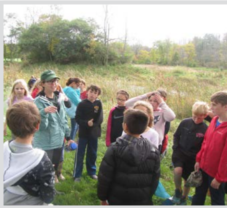
Fifth graders learn about the ecosystem at Evangola State Park.